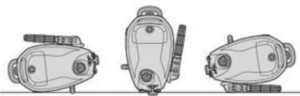
Three directions horizontal storage