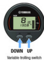
Variable trolling switch